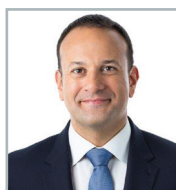
Leo Varadkar T.D. Taoiseach

We hope that you find this event both useful and informative. As this process continues, it is important that all views on the issues are heard.