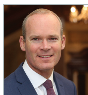
Simon Coveney T.D. Minister for Foreign Affairs & Trade