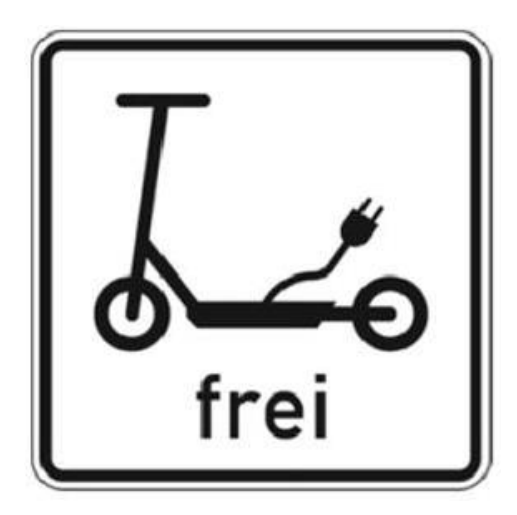
Figure 1: German traffic sign used to indicate that e-scooters are permitted for use

There are certain other restrictions, including a requirement for the vehicles to travel in a line (rather than abreast), users must not hold on to other vehicles, users must not ride hands-free, and users are recommended to wear a helmet.