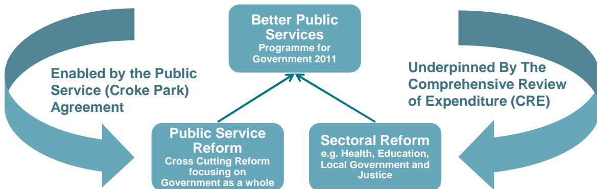
Figure 1: An Integrated Approach to Reform

Our approach to Reform aligns a number of key elements, including the Programme for Government, the Comprehensive Review of Expenditure, delivery of reform to frontline services within individual sectors, co-ordinated delivery of key cross-cutting reforms and the Public Service Agreement. Figure 1 below illustrates this integrated approach: